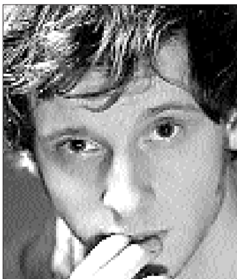
Jamie Bell as Hallam Foe

When his mother dies suddenly, it is declared as a suicide but Hallam is convinced that she has